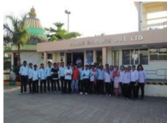
Visit of College of Agril. Biotech students to Parle Agro Industries, Igatpuri