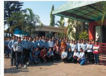
Visit of College of Agril. Engineering students to Jain Irrigation Pvt. Ltd., Jalgaon