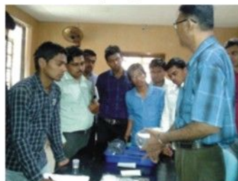
Visit of Agriculture College Students to Bio-control Laboratory, AAU, Anand (Gujarat)

Several visits were arranged for Under Graduate students. The perse motto of these visits was to motivate as well as acknowledge the students, to expose them to practical technology, and to interact them with progressive entrepreneurs.