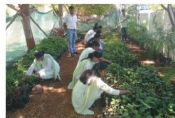
Student working in College Nursery

Under the experiential learning programme students of VIII semester undergone through Hands on training for the preparation of Nursery Sapling of various fruits & ornamental plants. They produce various bioagents & biopesticides and sold to the farmers. Value added milk products were prepared by them and sold to staff members. They also tested soil & water sample of farmer & given soil health card. Students prepared various bio-fertilizers & sold to grape, pomegranate, & vegetable growers of Nasik. They undertaken wheat seed production programme of MAHABEEJ & prepared tissue cultured saplings of Banana. Through all these activities they generated receipts and also gains entrepreneurial skills.