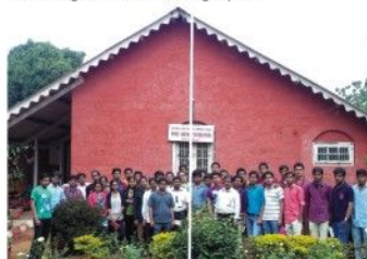
Visit of College of Agriculture Business Management Students to Honey Collection Center, Mahabaleshwar