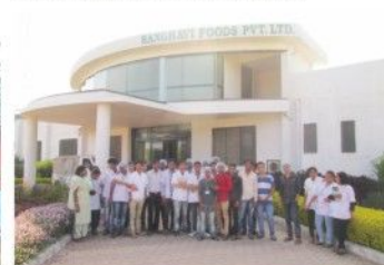
Visit of Food Technology students to Sanghavi Foods Pvt. Ltd., Damburni, Jalgaon