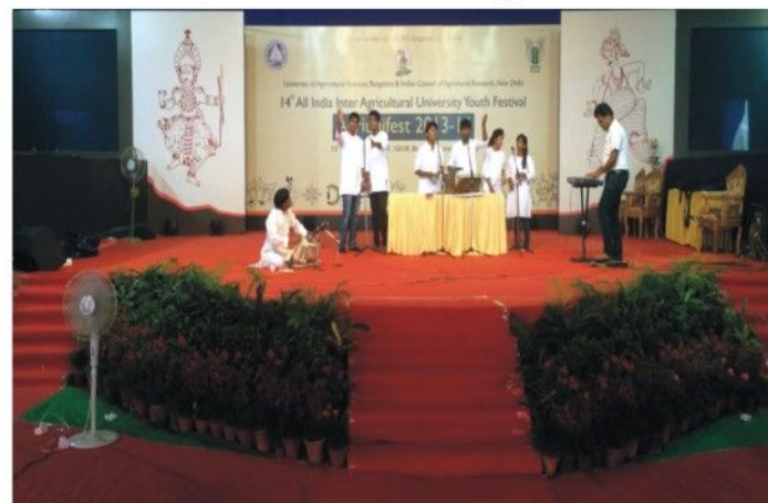
Participation of student of K.K.Wagh College of Agriculture in 14 th All India Inter Agricultural University Youth Festival 2013 -14 at USA, Bangalore .