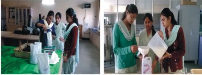
Students preparing carrier base Bio-fertilizer Preparation of liquid based Bio-fertilizers by students

All the Final Year B. Tech Agril. Engineering Students were undergone In plant Training at various industries/institutes for four months (Jan- April).