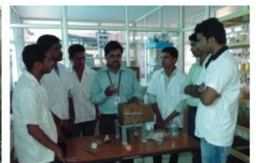
Corcyra Rearing at Bio control Laboratory