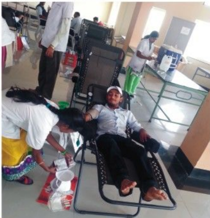
Blood donation camp organized by Agriculture and allied colleges on 3 rd January, 2014.