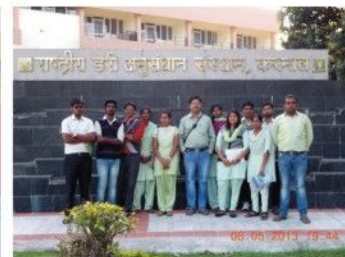
Visit of Agriculture College Students to NDRI, Karnal (Hariyana)