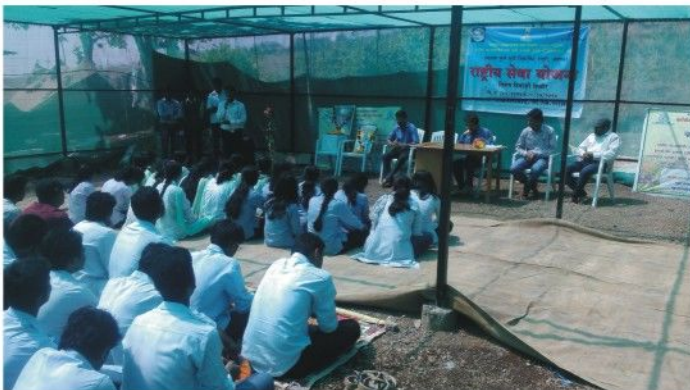
Inauguration of NSS Camp

K. K. Wagh College of Agricultural Engg., Agriculture, Agril. Bio Technology and Food Technology organized Camp of 125 students under this scheme at our Makhamalabad Farm from 9 th to 12 th March, 2014. During this period students undertaken various activities related to soil & water conservation. NSS student's participated in Krishi Dindi in 'Krishi Sahitya Sammelan 2014'