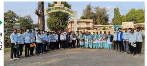
Seed production module student visited to ARS, Niphad on 11/01/2022