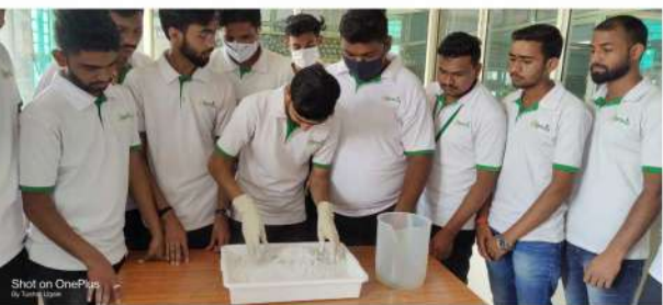
Bio- agents and Bio -pesticide production module students preparing formulation of Bio-pesticides