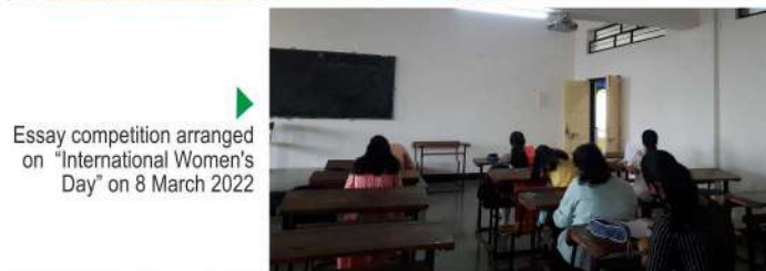
Essay competition arranged on "International Women's Day" on 8 March 2022