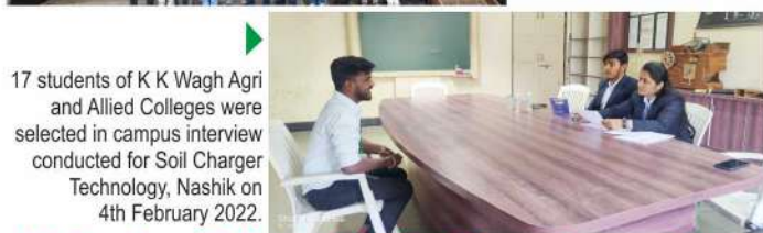
17 students of K K Wagh Agri and Allied Colleges were selected in campus interview conducted for Soil Charger Technology, Nashik on 4th February 2022.