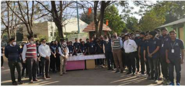
Dignitaries Visited to AHDS Modules Stall on 26 th January, 2022