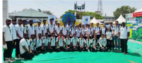
Experiential Learning Module student visit AIMA INDEX Industrial Exhibition 19 th March, 2022