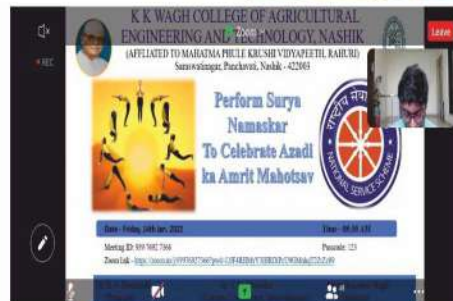
Celebrated Azadi ka Amrit Mahotsav to Perform Surya Namaskar on 14-01-2022