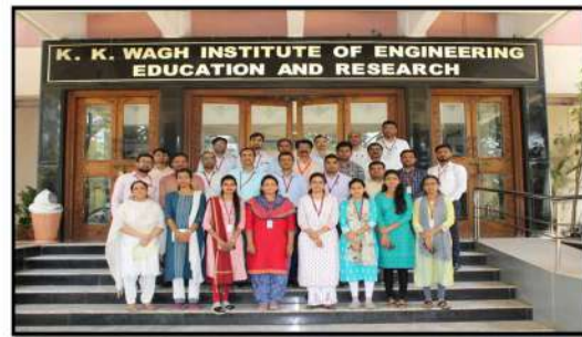
Five Days Faculty Development Program on Industry 4.0 under AICTE IDEA LAB