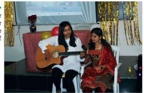
Cultural programme or farewell for last year student of Horticulture on 27/03/2022