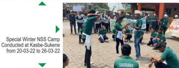
Special Winter NSS Camp Conducted at Kasbe-Sukene from 20-03-22 to 26-03-22