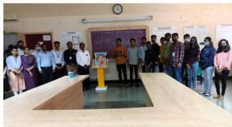
Savitribai Phule Purnyatithi on 10-03-22