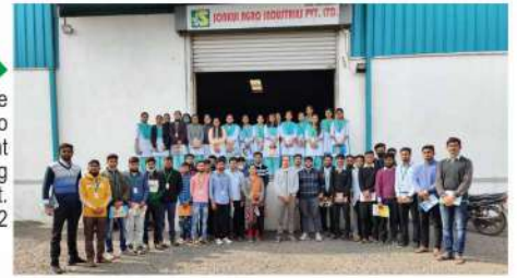
Experiential Learning Module student of SSAC visited to Sonkul Soil, Water, Plant and Fertilizer Testing Laboratory at Janori Dist. Nashik on 22/01/2022