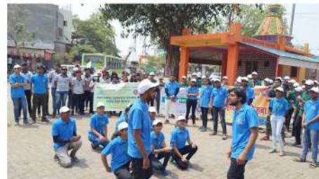
Arranged Street Play under National Service Scheme's "Special Winter Camp" At Kasbe Sukene on 27 March 2022 on topic "Manuski Jivant Ahe" to know people about their social responsibility