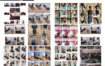
Celebrated Azadi ka Amrit Mahotsav to Perform Surya Namaskar on 14-01-2022