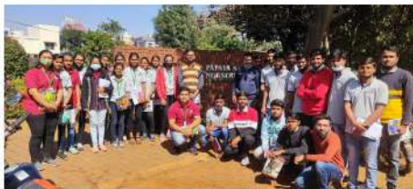
Visit to Papaya Nursery on 29/01/2022