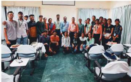
T. Y. B.Tech students visited to Jain Irrigation, Jalgoan on 04-05 th April, 2022