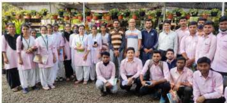
Visit to Tapovan Nursery on 20/01/2022