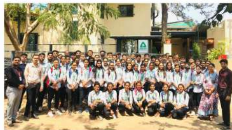
Educational visit at Advent Plantech LLP (Tissue Culture Lab) at Adgaon, Nashik on 05/03/2022