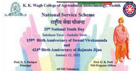
National Youth Day