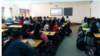
Students attending guest lecture on topic "Classroom to Successful Entrepreneur - New Career Opportunities" in classroom through zoom meeting on 10 th March, 2022