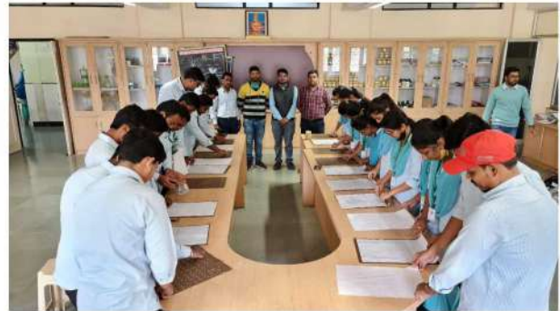
Seed production module students performing Seed germination test.