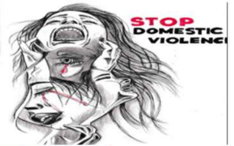
Sketch/Drawing competition arranged on "International Women's Day" on 8 March 2022 Sketch by- Miss Thakur Bhuvaneshwari