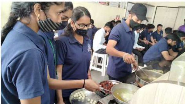
AHDS Module students performing practical on Preparation of Gulabjamun