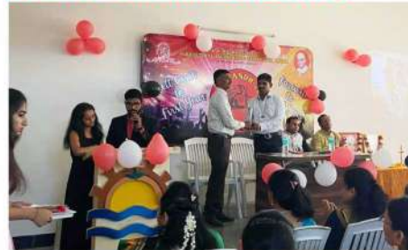
Freshers and Farwell function for first year and last year students was arranged on 17 th March 2022