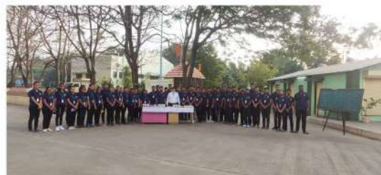
AHDS module students organized Exhibition of different Milk and Milk Products Stall on 26 th January, 2022