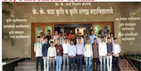
29 students of K K Wagh college of Agriculture, Nashik were appeared for Campus interview of Agri Search India Pvt Ltd on 23 rd March, 2022