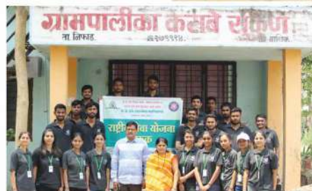
NSS Camp at Kasabe Sukene, 20/03/2022 to 26/03/2022