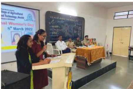
International Women's Day Programme