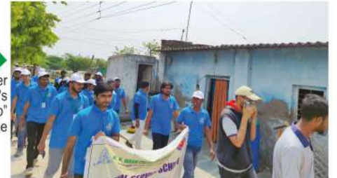
Arranged Rally under National Service Scheme's "Special Winter Camp" At Kasbe Sukene