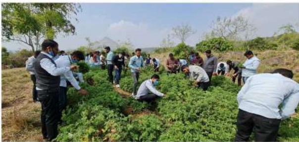
Preparation of Geranium cutting by experiential learning module students of Agriculture college