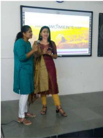
Women's Day Celebration organized by Women's Grievance Redressal Committee on 8/3/22 for girl students and ladies staff of K K Wagh College of Agriculture, Nashik