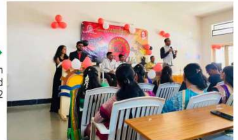
Platform for Interaction with Alumni was availed on 17 th March 2022