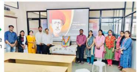
Mahatma Phule Jayanti celebration