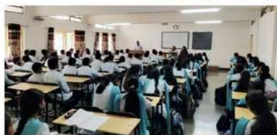
Guest lecture of "Personality Development & Interview Technique" on 25 th March, 2022