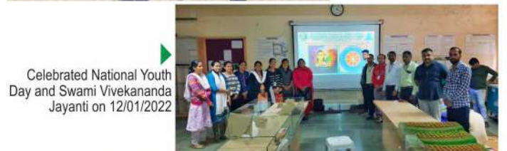
Celebrated National Youth Day and Swami Vivekananda Jayanti on 12/01/2022