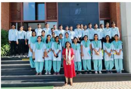
T.Y.B.Sc (VI Sem) students visit to Sahyadri Farms on 16/03/2022 under the course HORT-366 Postharvest Management and Value Addition of Fruits & Vegetables