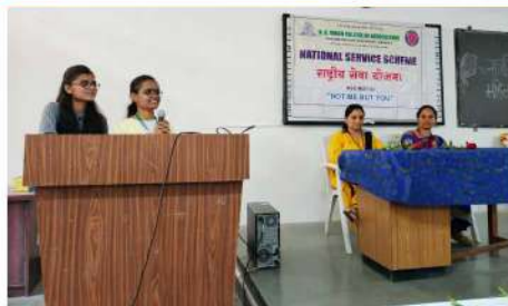
Celebrate International Women's Day, Date:- 8 March 2022