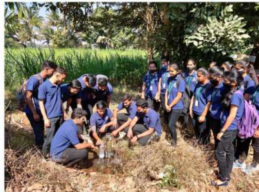
SSAC module students performing practical on Water sample collection