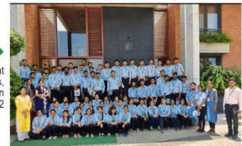
Educational visit at Sahyadri Farms, Mohadi on 09/04/2022