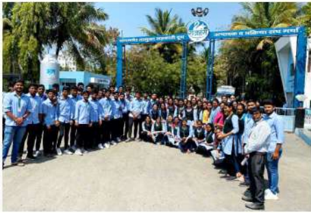
Visit of Third Year student at Sangamner Taluka Duddh Sangh, Sangamner on 14/03/2022