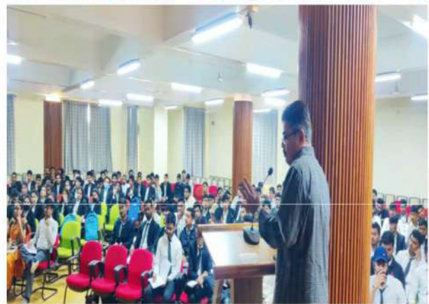
Two day Entrepreneurship Development Programme was organized during 24/03/2022 to 25/03/2022 by K.K. Wagh College of Agriculture Business Management, Nashik. Details of resource person and schedule of programme as follows: