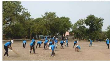
Cleaning Campaign under National Service Scheme's "Special Winter Camp" At Kasbe Sukene on 26 March 2022