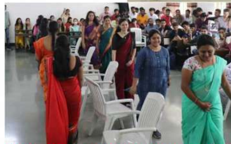
Women's Day celebration at Hall No.1 K. K. Wagh College of Food Technology, Nashik, on dated 08/03/2022