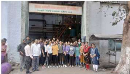
Visit of Second Year student at Kadwa Sugar Factory, Dist-Nashik on 09/03/2022