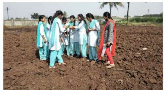
SSAC module students performing practical on collection of Soil Sample.