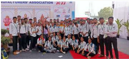
F.Y., S.Y. and T.Y.B.Tech students visited to AIMA INDEX Industrial Exhibition on 21 st March, 2022