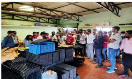
Visit to Sanap Nursery on 22/02/2022