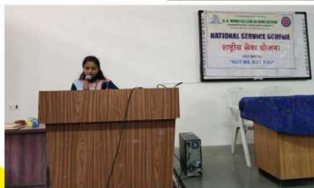
Poem Recitation competition arranged on "International Women's Day" on 8 March 2022