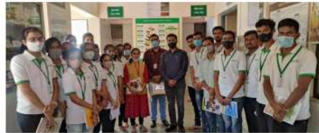
Experiential Learning Module student visited to Bio-Control Laboratory KVK, YCMOU Nashik 22/02/2022