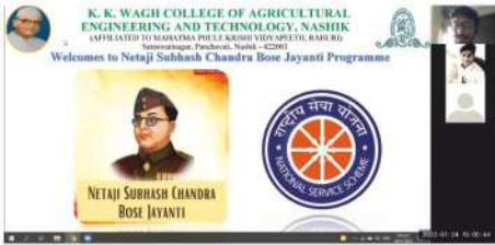
Netaji Subhash Chandra Bose Jayanti was celebrated on 24/01/2021