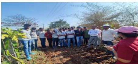
Visit to Dragon fruit farm visit Dindori on 22/02/2022